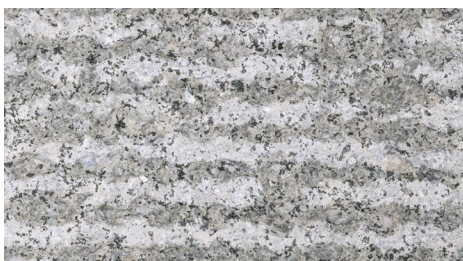
Hermes | Lineal Extreme Light