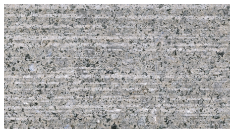
Hermes | Lineal Plus