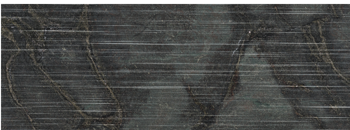
Hathor | Lineal