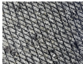
Ceres | Double Wave