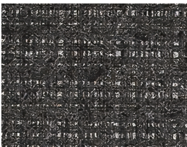
Ceres | Cotton