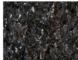
Ceres | Rock