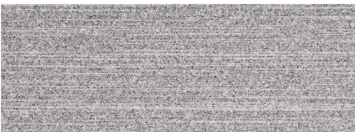
Cybele | Lineal Plus